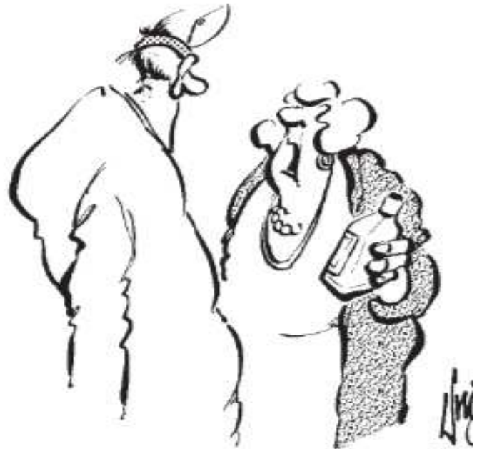
HERM